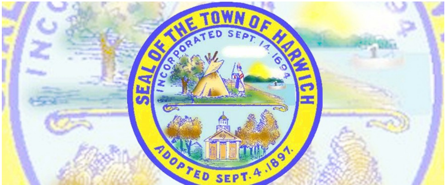
Harwich town seal.

HARWICH – The town has scheduled an Oct. 26 auction of a dozen or more properties taken for non-payment of taxes.