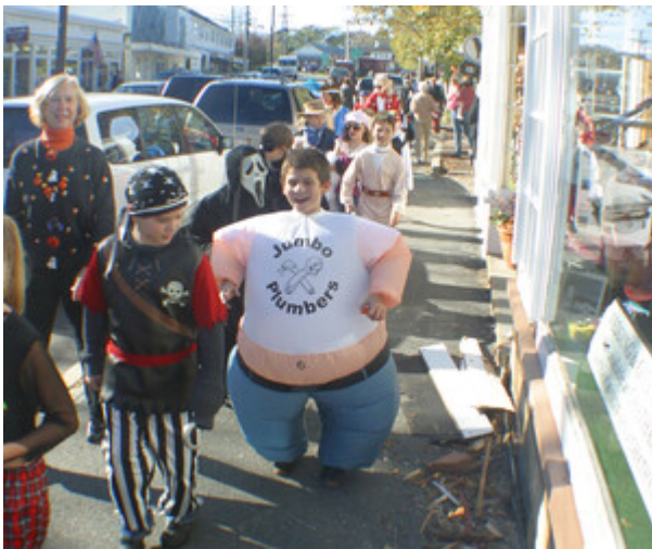
Chatham Elementary's Halloween Parade, 2005.